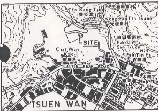
SCALE 1:20 000