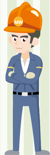
Minor Works Contractor

In general, the BD will issue an acknowledgement letter within four working days upon receipt of a minor works submission. If the submissions are delivered by hand, the BD endeavours to issue the acknowledgement letter on the same day over the counter. However, it is noted that the submission delivery peaks during the last two hours before closing. To reduce the waiting time, a new arrangement for minor works submissions has been implemented. For a batch of more than five submissions delivered after 4:00 p.m., the BD will issue acknowledgement letters on the next working day. If you wish to receive a faster services, please deliver minor works submissions in the morning session of the opening hours.