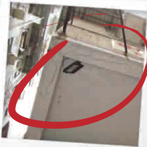
Cracks on the beam