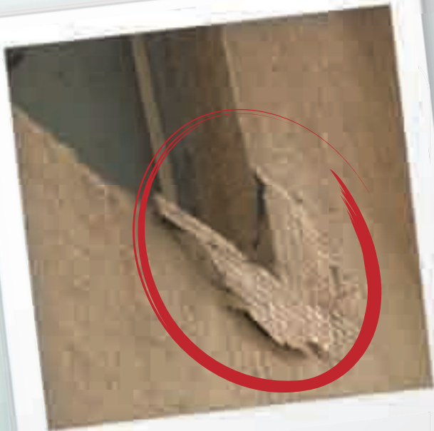
Bulging and loosening of wall tiles