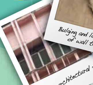
Defective architectural fin