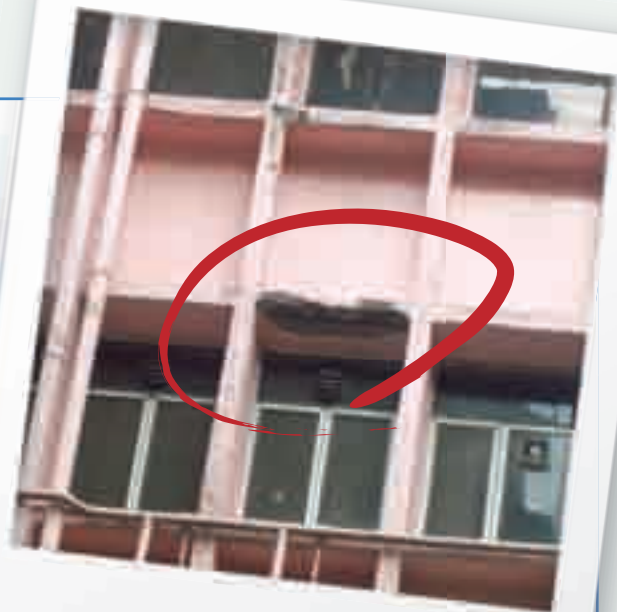
Defective architectural fin