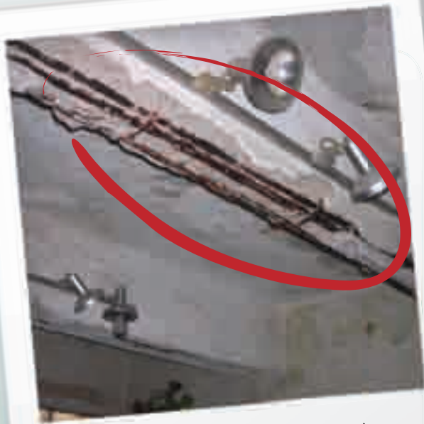
Spalling of concrete at beam soffit