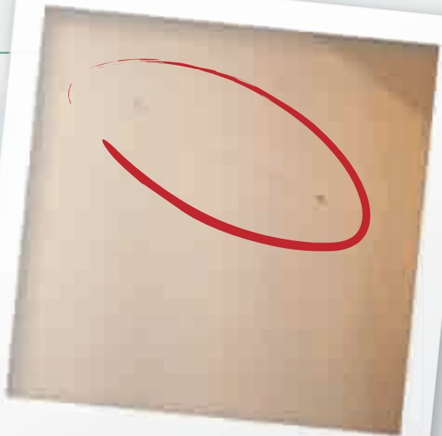
Fine cracks on wall