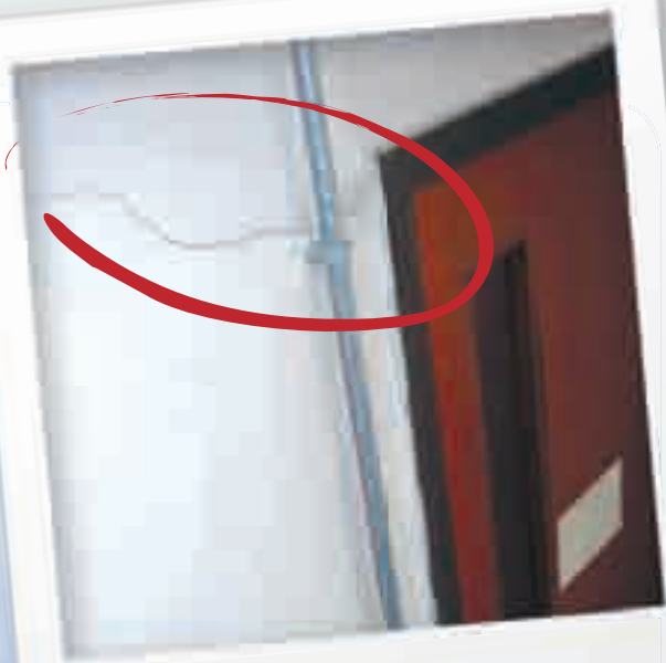
Cracks at the corner of door frame