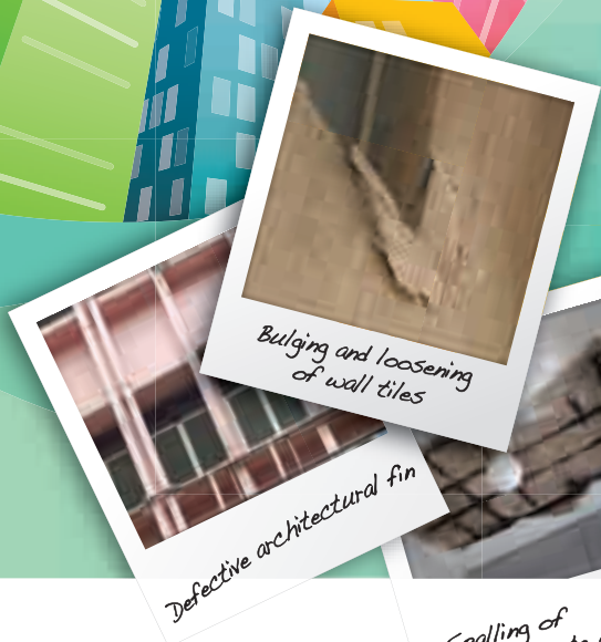
Bulging and loosening of wall tiles