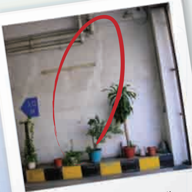
Cracks on partition wall