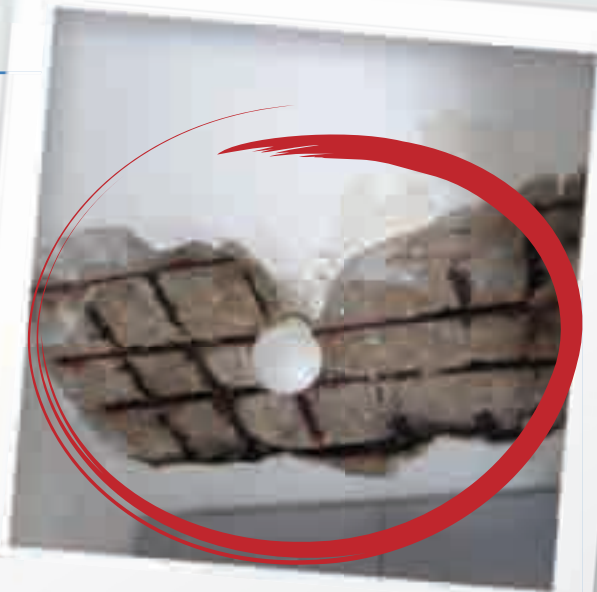
Spalling of concrete at ceiling