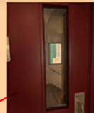
Vision Panel (if applicable)