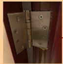
Stainless Steel Hinges