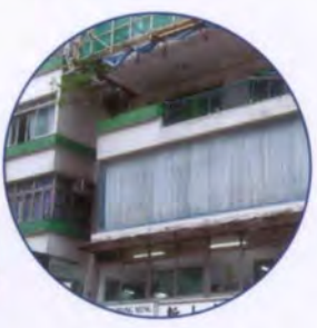
Examples of Large Glass Panels