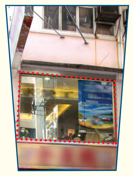
Large glass panels which do not comply with regulations