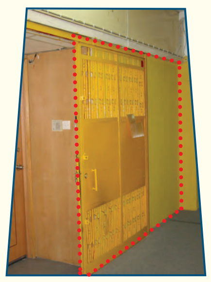
Metal gate of individual unit entrance not obstructing the means of escape