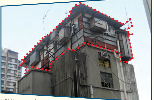
UBW on rooftop