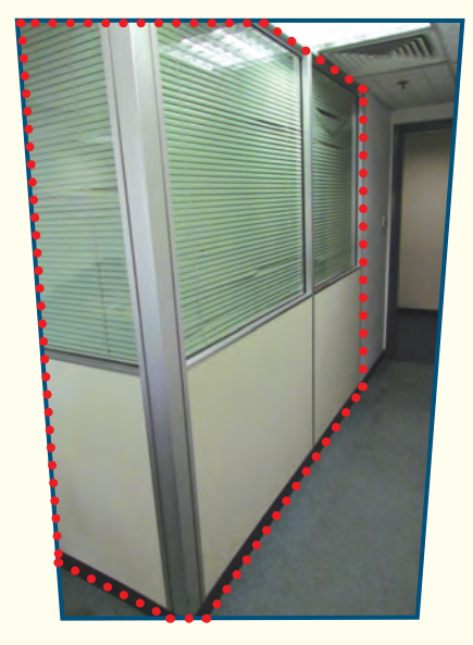
Lightweight partition board wall