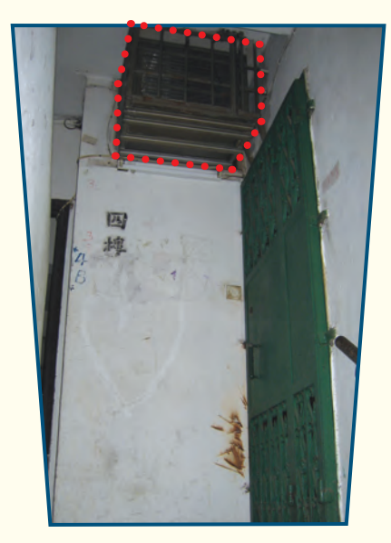
Opening formed in the staircase enclosure wall