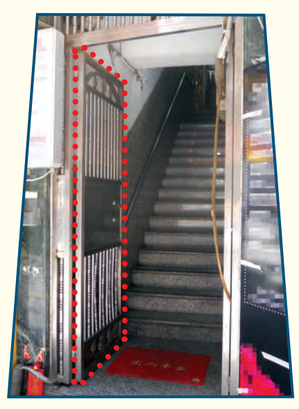
Metal gate obstructing the means of escape