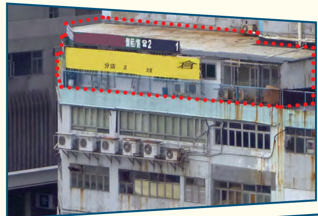
UBW on podium flat roof