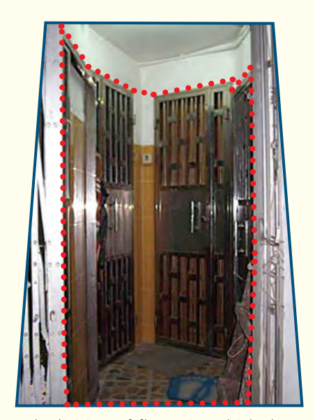
Sub-division of flat units which does not comply with regulations