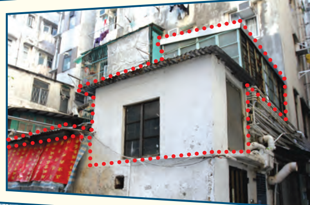
UBW in yard