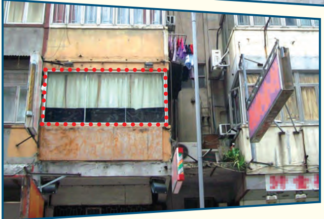
Enclosed balcony which does not comply with regulations