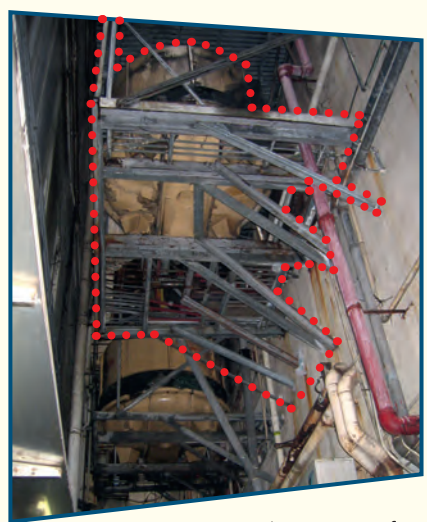
Supporting Frame for Air-conditioner / Water Cooling Tower on external wall