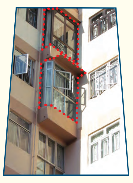
Window enclosure on approved planter