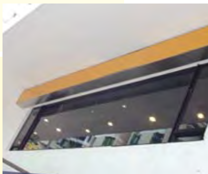
Window or Window Wall

For detailed descriptions and specifications of the minor works as mentioned above, please refer to the B(MW)R or visit the Buildings Department website at http://www.bd.gov.hk .