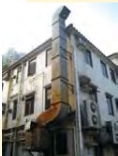
Removal of Chimney