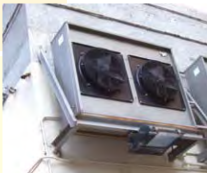
Supporting structures for air-conditioners and associated air ducts