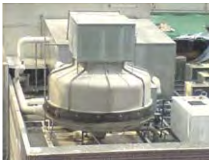
Supporting structures for water cooling towers and associated air ducts