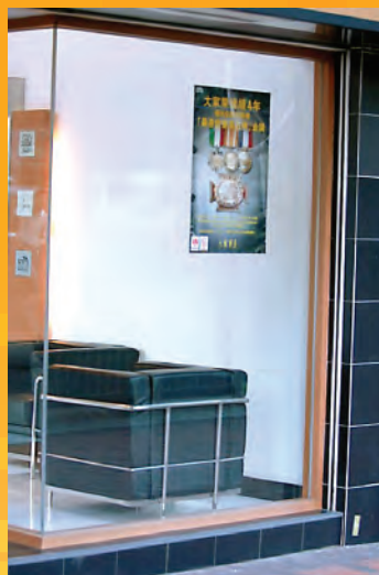
Span of structural element \leq 6\text{m}