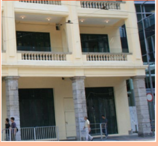
A verandah generally projects from the wall and is supported by columns or walls on both sides