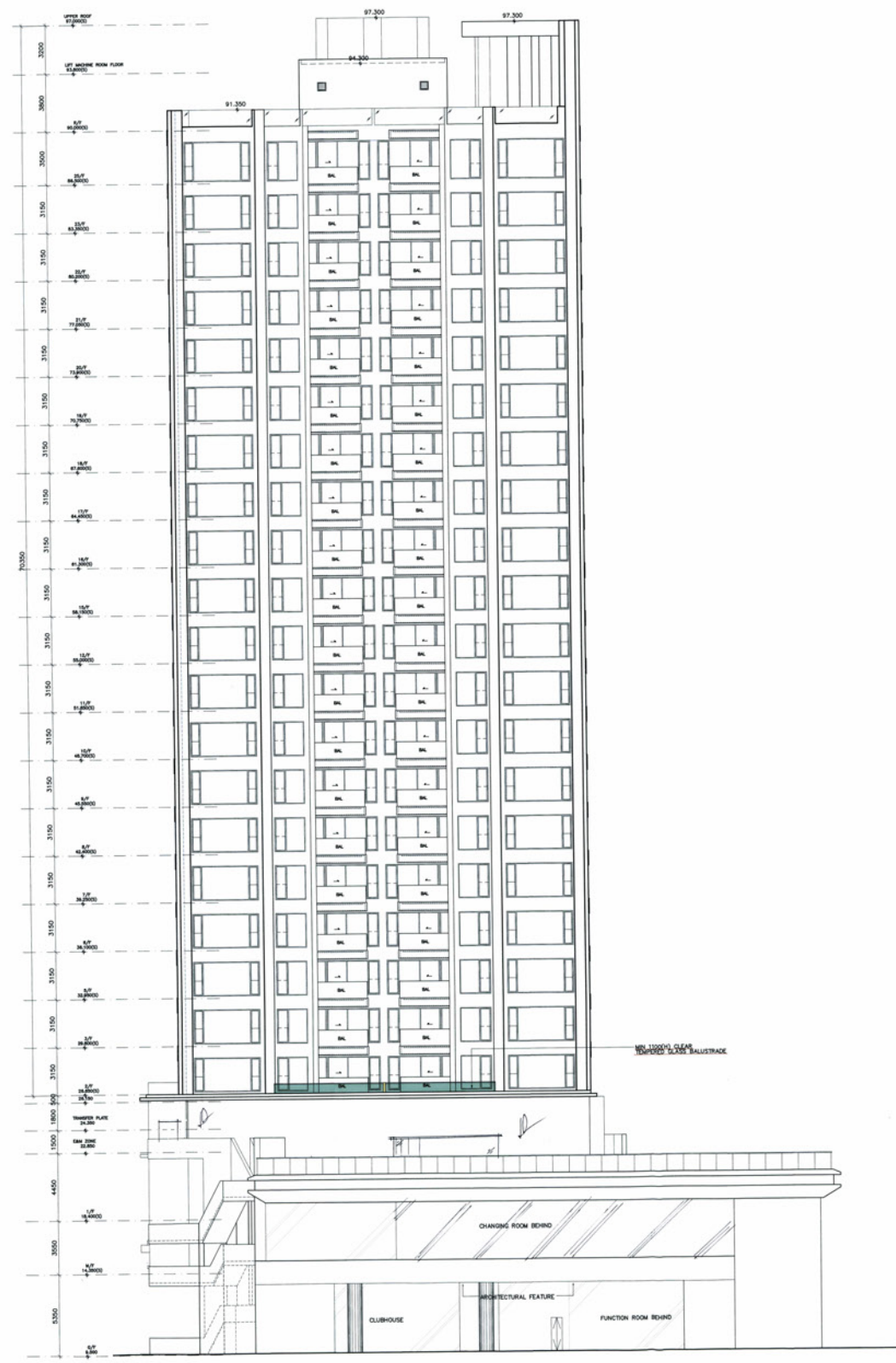
TOWER 3A EAST ELEVATION 1

STATEMENT II : THE WORKS SHOWN ON THESE PLANS ARE TYPE II WORKS IN RESPECT OF WHICH THE BUILDING AUTHORITY'S CONSENT IS APPLIED FOR.