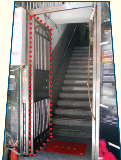
Metal gate obstructing the means of escape