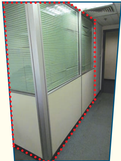
Lightweight partition board wall