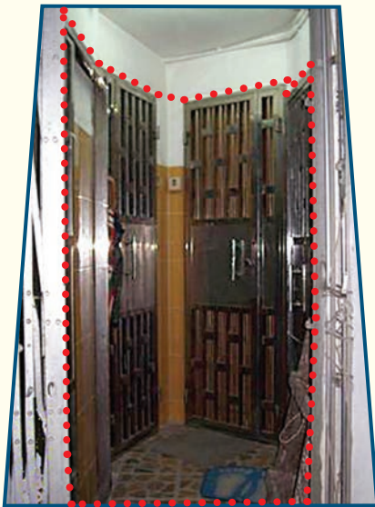
Sub-division of flat units which does not comply with regulations