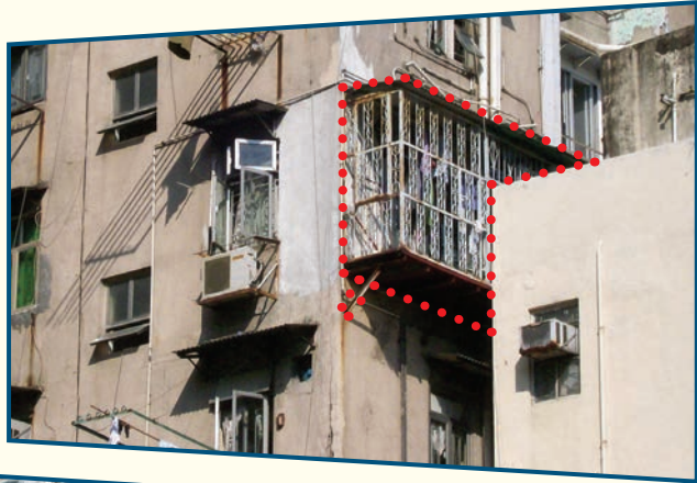
Metal cage attached to external wall