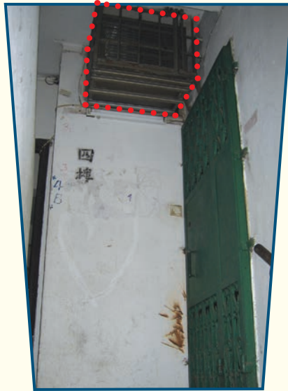
Opening formed in the staircase enclosure wall