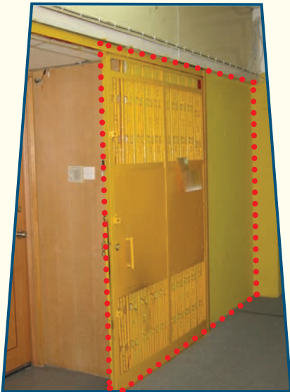
Metal gate of individual unit entrance not obstructing the means of escape