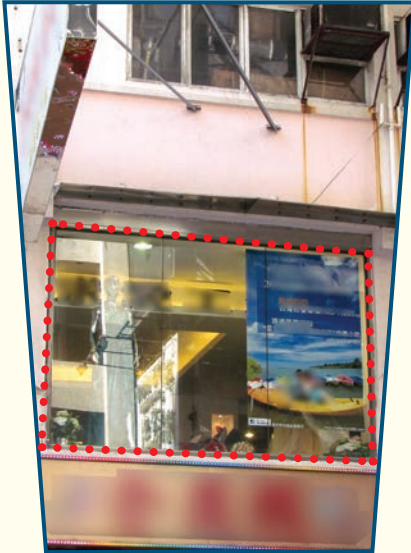
Large glass panels which do not comply with regulations