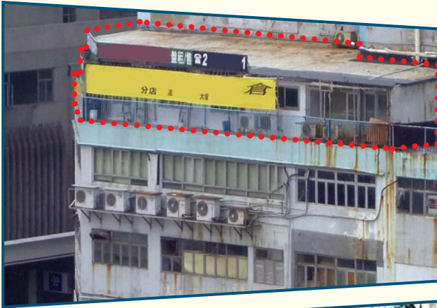
UBW on podium flat roof