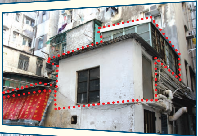
UBW in yard