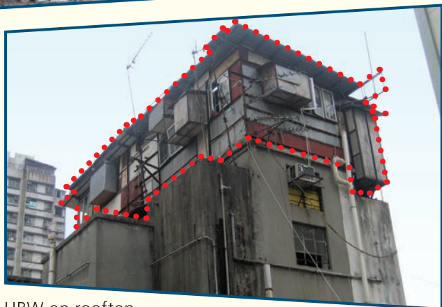
UBW on rooftop