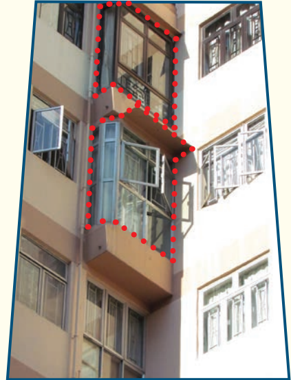
Window enclosure on approved planter