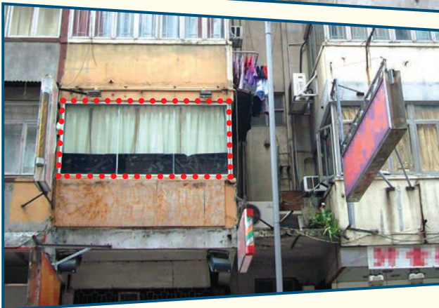
Enclosed balcony which does not comply with regulations