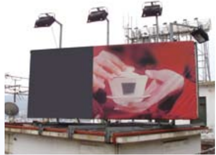
Signboard on the roof of a building