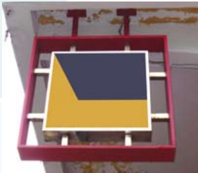
signboard on or hung underneath the soffit of a balcony or canopy (other than a cantilevered slab balcony/canopy)