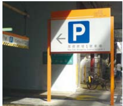
Outdoor signboard erected on-grade