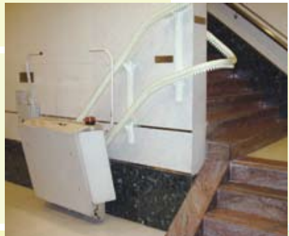
Building works associated with stairlift or lifting platform

For detailed descriptions and specifications of the minor works as mentioned above, please refer to the B(MW)R or visit the Buildings Department website at http://www.bd.gov.hk .