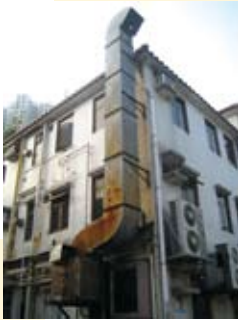
Removal of Chimney