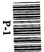
DEDICATION PLAN 1 : 300

For and on behalf of HARVEST RISE DEVELOPMENT LIMITED 利達高發展有限公司