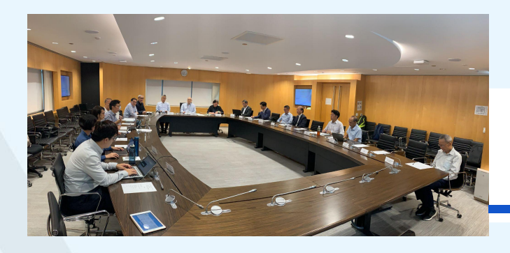
7<sup>th</sup> meeting Task Force on Industry Adoption of ESH 29 August 2023